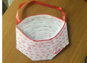
Add a handle and colour the basket