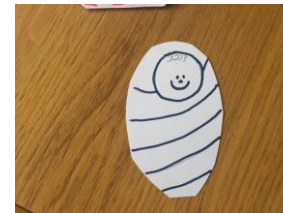
Cut out and colour baby Moses