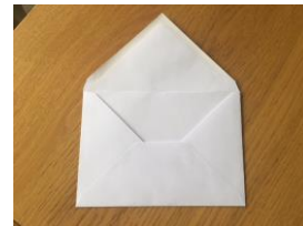
Find an envelope