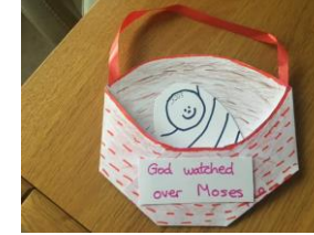
Pop Moses in the basket

Add a reminder that God was watching over Moses